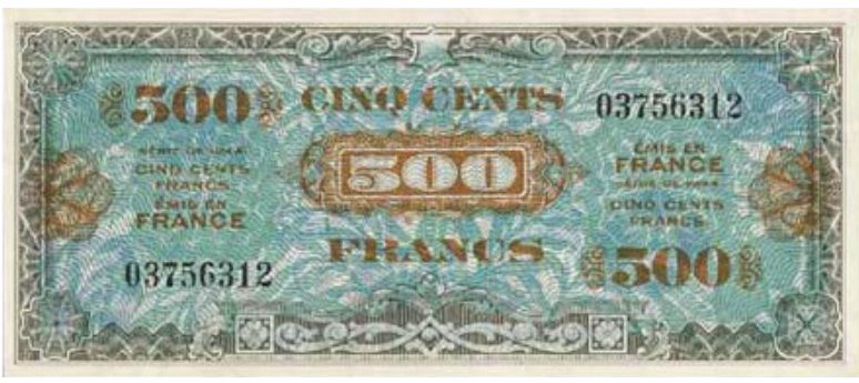
Copy in UNC grade sold £380 by Spink in 2010, sale of the Tom Warburton Collection (#1031)