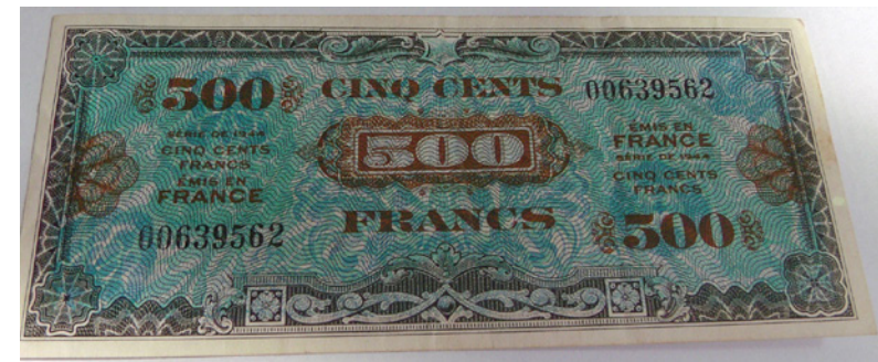
Smallest known number. For sale at €91 on ebay in April 2015.